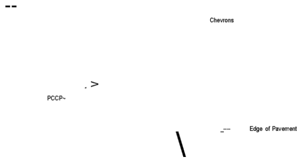
FIGURE 2 - Showing that the spacing of the Chevron Signs allow the driver to see at least three (3) signs in view while negotiating the curve until the change in alignment eliminates the need for the signs as contained in the 4 paragraph of Section 620.2.2, Design for Item 620 - Chevron Signs

Chevron signs shall be mounted clear of roadside vegetation and clearly visible under headlight illumination by night. Chevrons should be installed 1.5m above the ground in the rural areas and 2.2m in the urban areas. The recommended spacing for the chevrons within a curve is shown in Table 620.1.