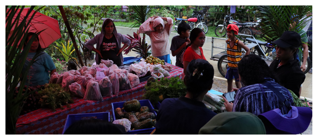
The townsfolk of Maraguyon go back into farming after the construction of the FMR which now eases the hauling and transport of their produce from their farms to the market.