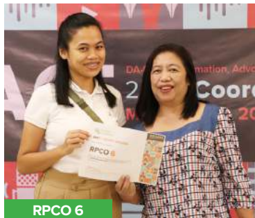
RPCO 6 • Best in Project/Subproject Updates • Visayas Best Performing RPCO InfoACE Unit