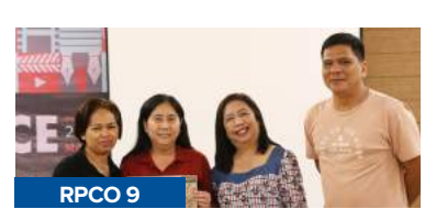
RPCO 9 • Most Captured Testimonials