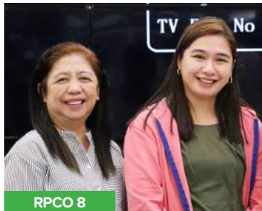
RPCO 8 • Best in Project/Subproject Updates