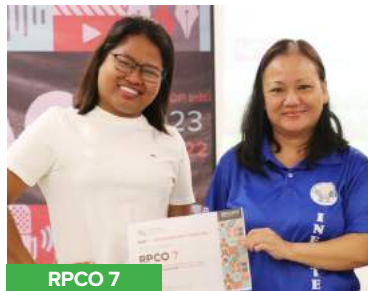
RPCO 11 • Best in Project/Subproject Updates