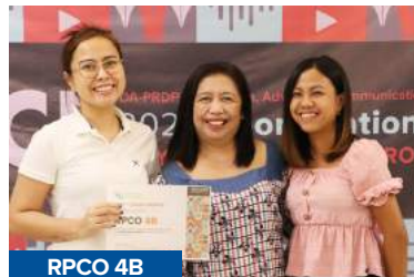
RPCO 4C • Best in Project/Subproject Updates