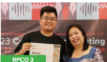
RPCO 3 • Best in Project/Subproject Updates