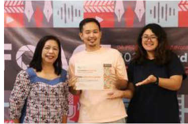
PSO South Luzon Outstanding Newsletter Write-Ups and Design