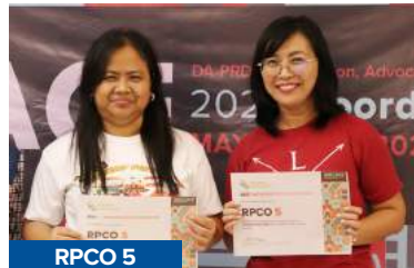
RPCO 5 • Best Initiative (PRDP Bicol Podcast) • Best in Microcontent Creation