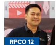
RPCO 12 • Best in Project/Subproject Updates