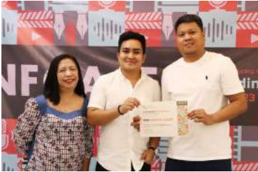
PSO North Luzon Outstanding Photography and Videography