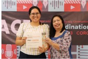
PSO Visayas Outstanding Broadcast Content Contributor