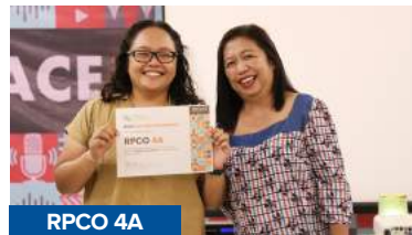
RPCO 4A • Best in Featuring Commodities and PG Products • Most Captured Testimonials • Best in Social Media Content • Recognition for Using Local Language in Communication Materials • South Luzon Best Performing RPCO InfoACE Unit