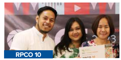
RPCO 10 • Best in Project/Subproject Updates