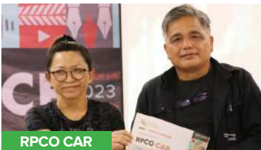
RPCO CAR • Best in Article Writing • Best in Social Media Engagement • North Luzon Best Performing RPCO InfoACE Unit