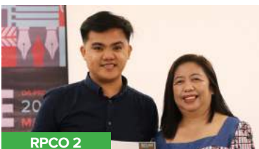
RPCO 2 • Best in Microcontent Creation • Most Captured Testimonials