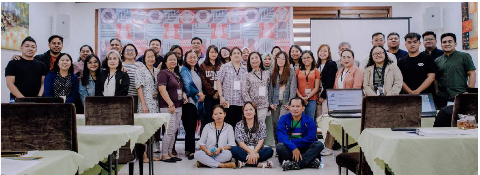
People behind the camera and stories. The information and media arm of the DA-PRDP, the InfoACE Units from the NPCO, PSOs, and RPCOs, gather once again to discuss the communication plan for the PRDP Scale-Up to reflect more success stories by focusing on human interest, to engage more with local audience by using vernacular language, to reach more people by conducting more information caravans and venturing into new avenues of content creation.