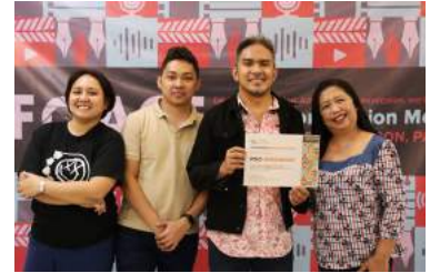
PSO Mindanao Outstanding Media Production