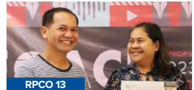
RPCO 13 • Best in Microcontent Creation • Most Captured Testimonials • Mindanao Best Performing RPCO InfoACE Unit