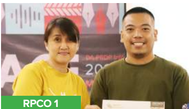
RPCO 1 • Best in Photo