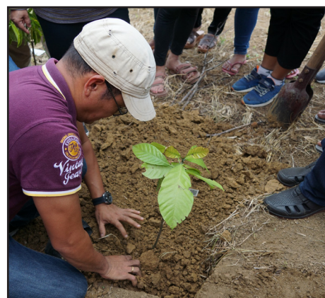
A technician demonstrates the proper transfer of coffee seedlings from the nursery to the farm.

PRDP’s inter-agency convergence continues to serve as a platform to institutionalize synergistic partnership among various value chain enablers in addressing gaps, constraints of priority value chains in the agri-fishery sector. 🌱