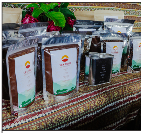
TIFWA is now processing their own coffee beans and marketing their products under the "Sandawa" brand name.