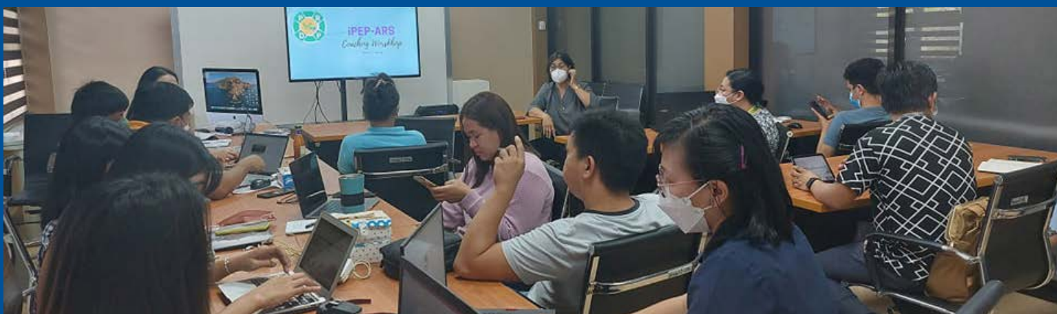
The DA-PRDP RPCO V conducts the iPEP-ARS Coaching Workshop