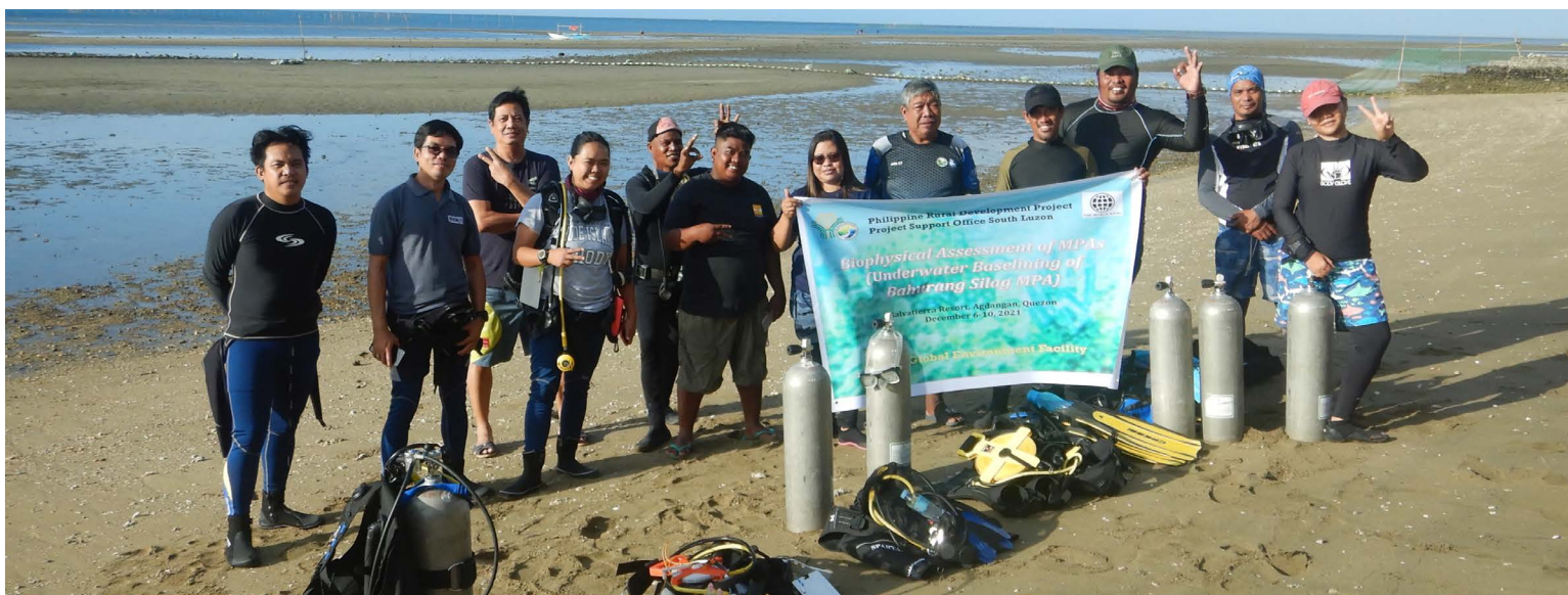
The DA-PRDP GEF team in Agdangan, Quezon