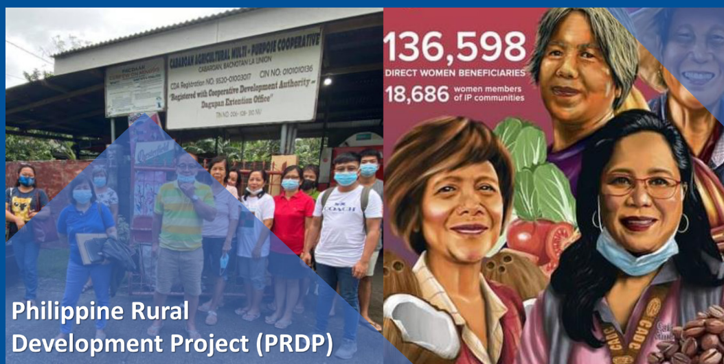
Philippine Rural Development Project (PRDP)

for recognizing the DA-PRDP's efforts of utilizing digital methods for real-time data collection and analysis.