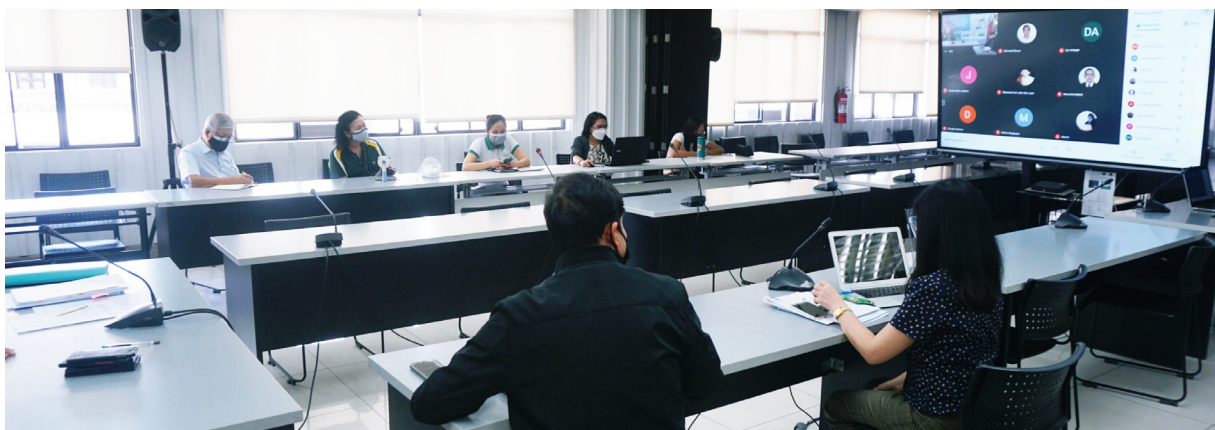
Officials from several national government agencies such as the DA, DOF, NEDA, DBM, DOJ, and BSP gather online via teleconferencing to participate in the loan negotiation of the AF2-EU.