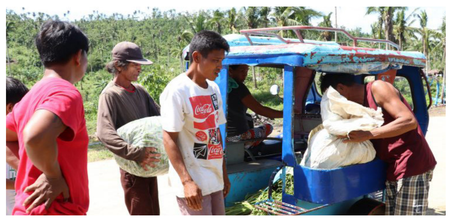
Farmer-beneficiaries of the Batang-San Gabriel FMR transfer their harvest to the mobile service of one of their retailers.

"Mas lalong magaan ang buhay mi ngunyan na may magayon na kaming tinampo na naaagihan. Digdi samo halos pag-uuma saka pagtatanom ning gulayon ang kabuhayan. Kadto nagtitiyaga kami na mag-agi sa laboy, ngunyan dai mi na kaipuhan magduman sa luwasan ta mismong mga paratinda asin mga parabakal na an nadidigdi samuya ta magayon na po tinampo,"