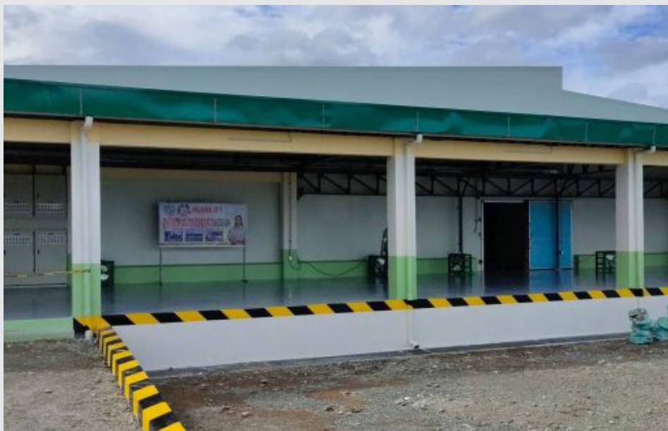
Palayan cold storage