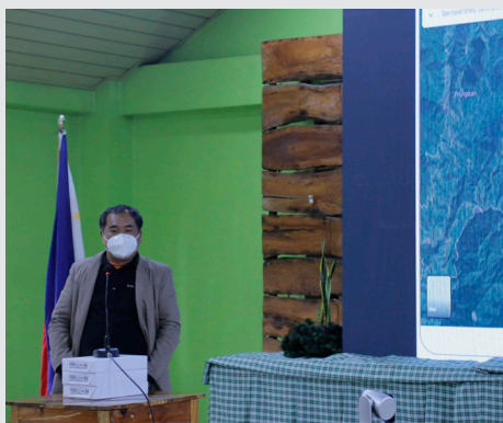
Ifugao Gov. Jerry U. Dalipog discusses the overview of the proposed water system in the municipality of Lagawe.