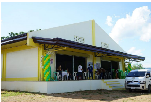
HMPC storage warehouse