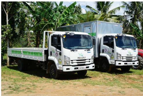
One unit hauling and delivery truck from DA-PRDP