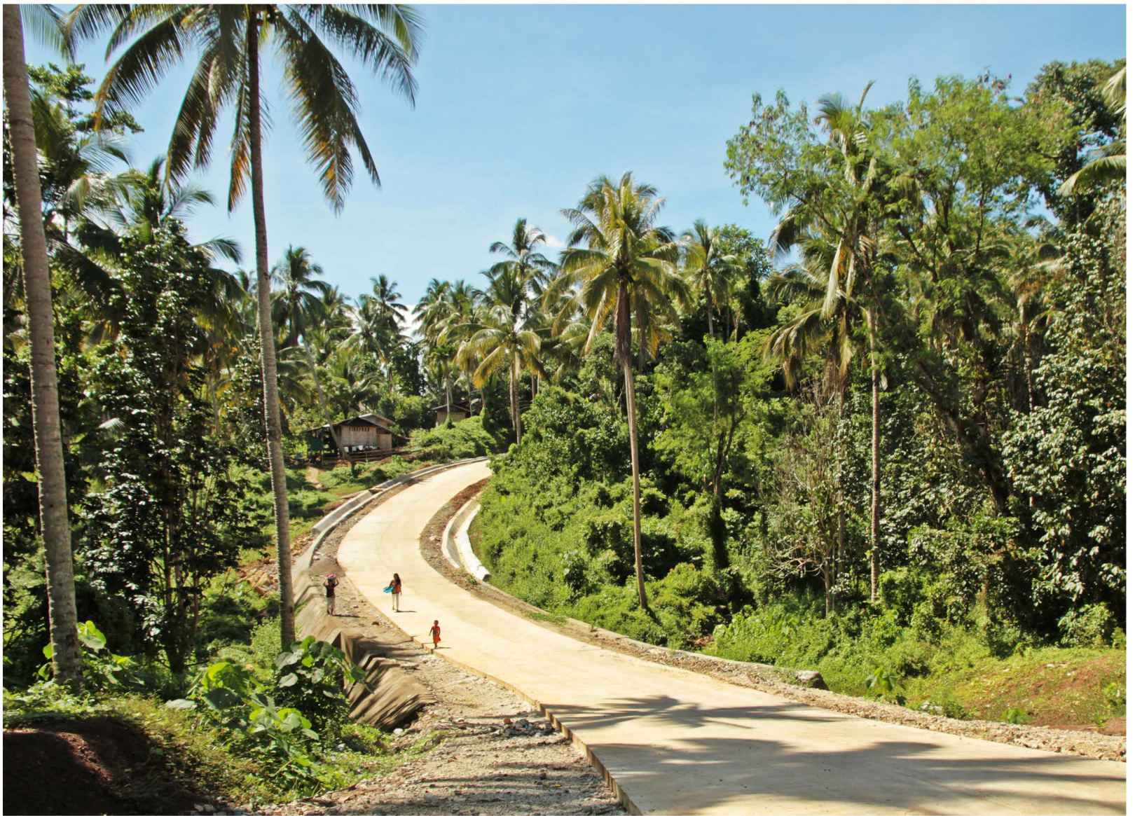
Trail No More. Residents walk along a newly paved portion of the 3.6-kilometer Pamintayan-Bawang farm-to-market road (FMR) in Buug, Zamboanga Sibugay. The P46.9 million-worth FMR, which used to be a mere dalan-dalan or trail, is being upgraded under the Department of Agriculture's Philippine Rural Development Project (DA-PRDP).