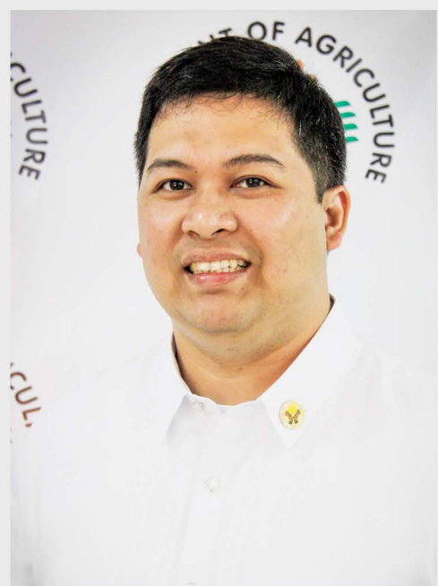
PRDP at the Director's Cue