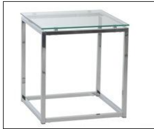
Item no. 6 Side table