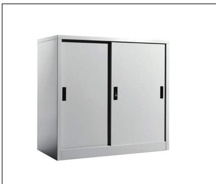
Item no. 17 Upright steel cabinets set - Bottom cabinet

Note: All photos shown are for reference only. Supplier shall coordinate with the End-User for approval of design of furniture.