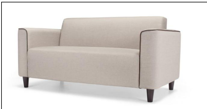
Item no. 14 2-seater sofa with armrest