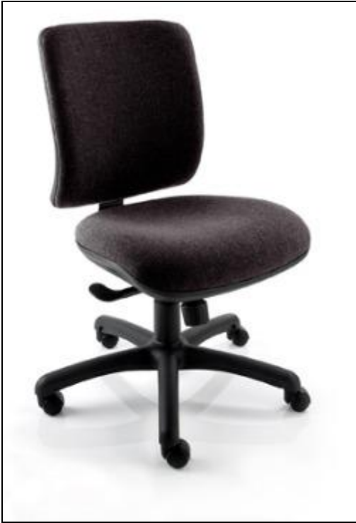
Item no. 10 Low-back office chair without armrest