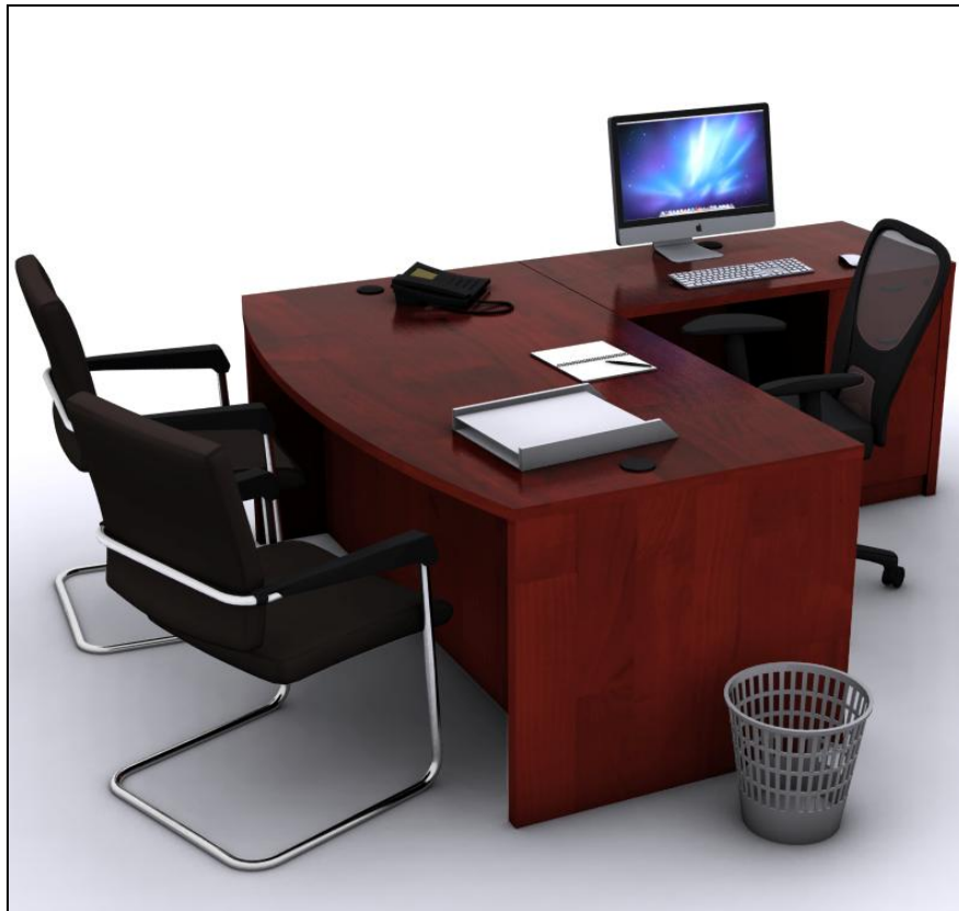
Item no. 2 L-shape executive table

Note: All photos shown are for reference only. Supplier shall coordinate with the End-User for approval of design of furniture.