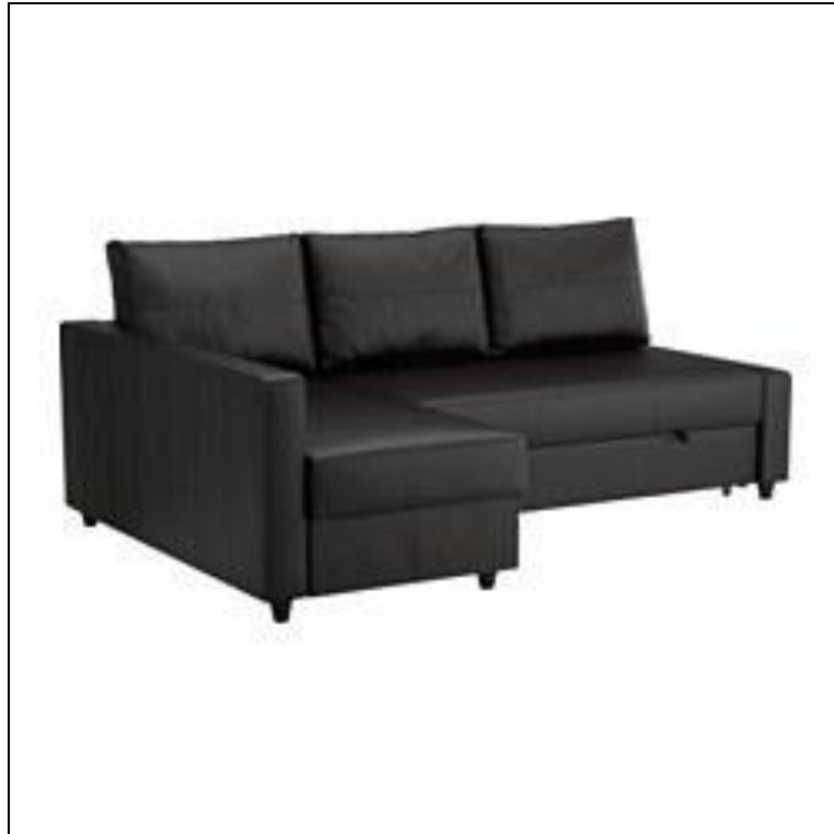
Item no. 12 L-shape sofa without armrest

Note: All photos shown are for reference only. Supplier shall coordinate with the End-User for approval of design of furniture.