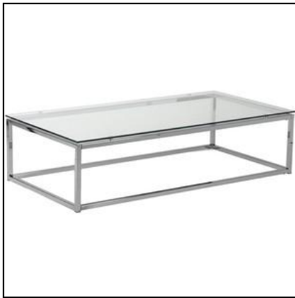
Item no. 5 Center table