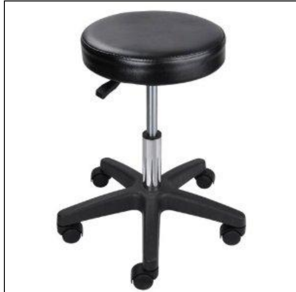
Item no. 11 Hydraulic stool