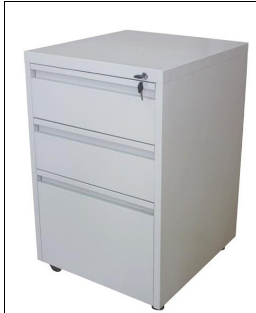
Item no. 19 / 20 Mobile pedestal drawer cabinet (Type 1 & 2)

Note: All photos shown are for reference only. Supplier shall coordinate with the End-User for approval of design of furniture.