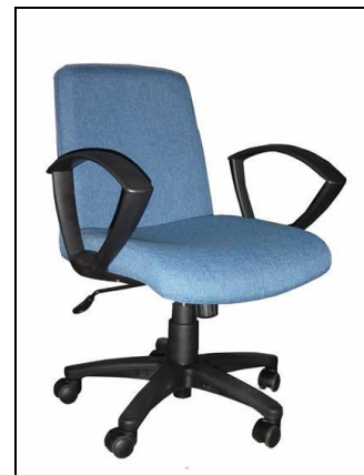
Item no. 9 Low-back office chair w/ armrest

Note: All photos shown are for reference only. Supplier shall coordinate with the End-User for approval of design of furniture.