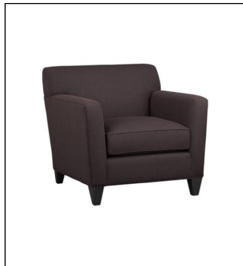
Item no. 15 Single-seater sofa with armrest