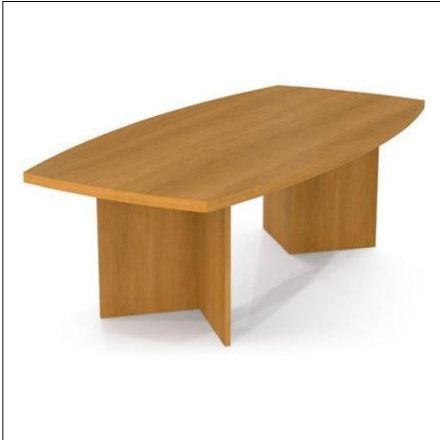
Item no. 1 Boat shape conference table