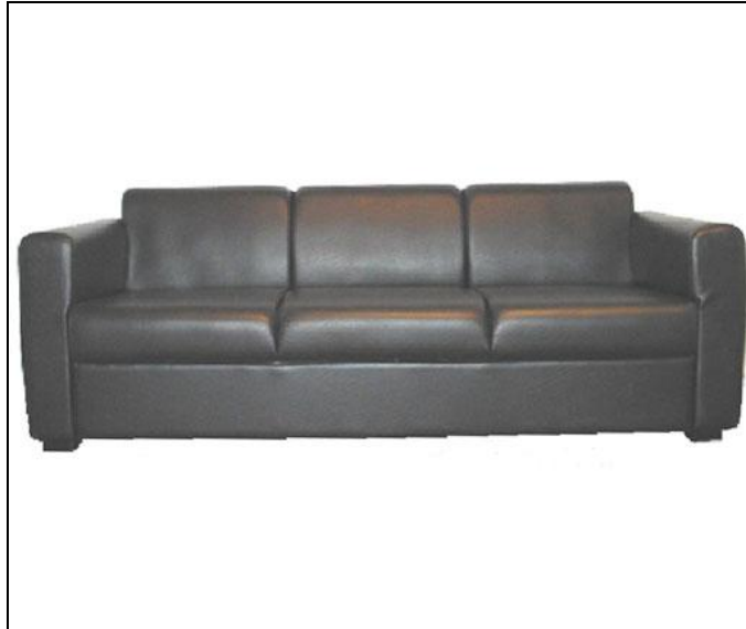
Item no. 13 3-seater sofa with armrest