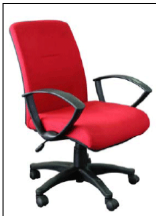
Item no. 8 Mid-back office chair w/ armrest