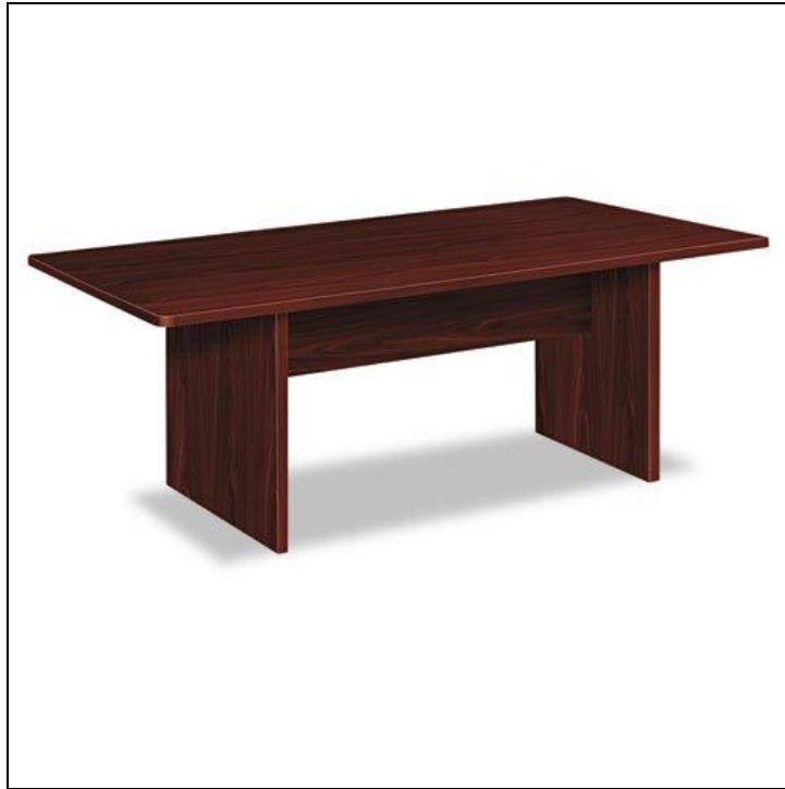
Item no. 3 / 4 Rectangular table A / B