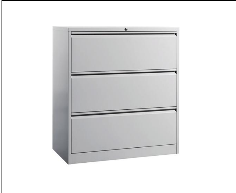
Item no. 18 Lateral file drawer cabinet