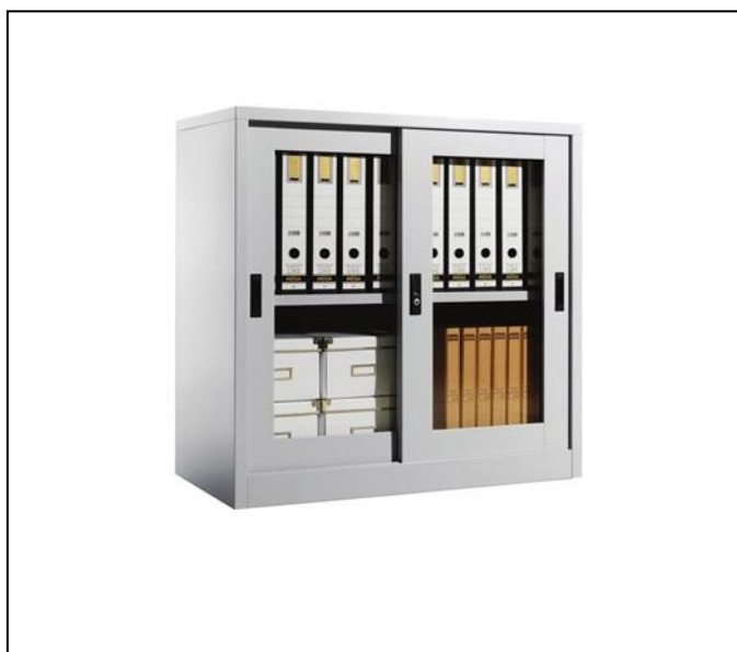
Item no. 17 Upright steel cabinets set - Top cabinet